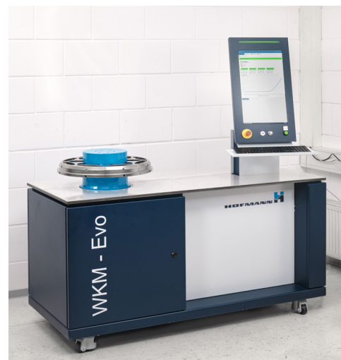
WKM-Evo 12" - 30"

The new generation of bead compression machine WKM-Evo allows easy and rapid verification whether the bead parameters are within the acceptable limits. The expansion force of the tire bead as a function of its diameter is of great importance for the mounting process and the safety during driving.